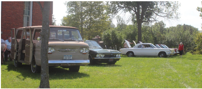
More Tonawanda Kenmore Museum