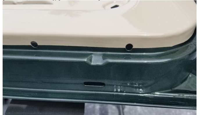
inside color (light Fawn) and outside color combo.