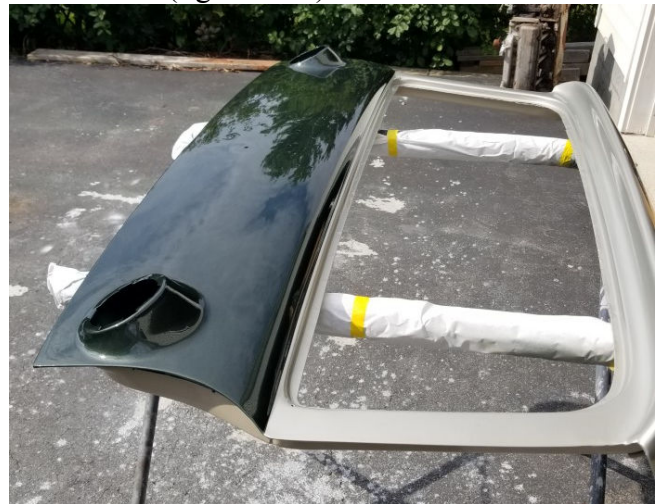
contrasting roof color. Moonbeam beige metallic