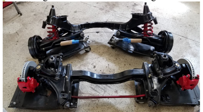
Front and rear suspension ready to go!