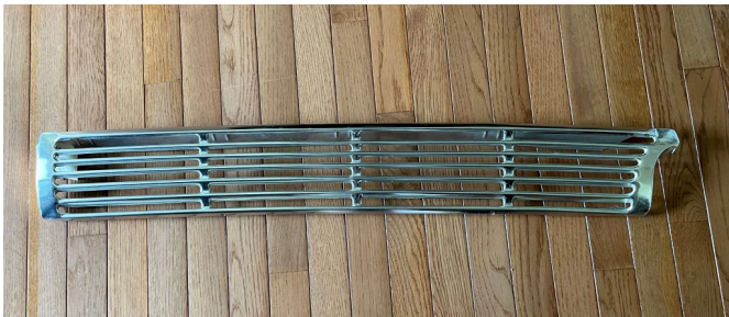
Tom was able to trade an NOS 64 Grille for an NOS 62 Wagon Grille.