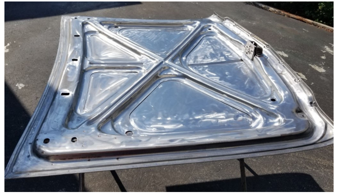
Finally found a hood relatively close to me in excellent shape. I had come out of California and the guy had it in inside storage for 30 years. Stripped it fully, epoxy primed, sanding primer and painted.