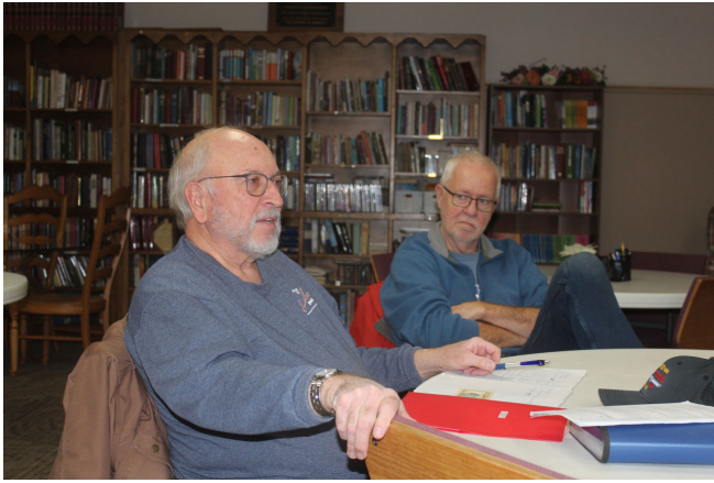
More from Dec meeting.