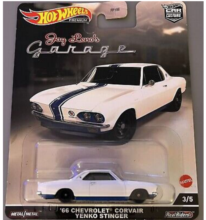
Did everyone find one of these yet? Latest Corvair toy from Hot Wheels.