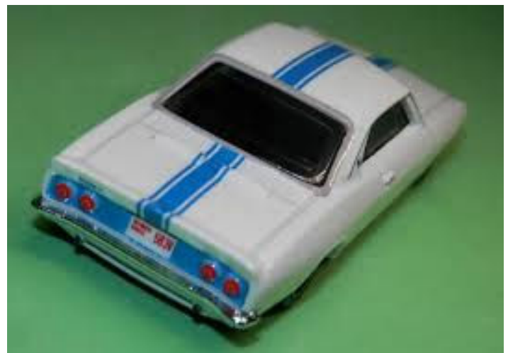
Meeting January 18 th at 6:00 PM! At First Trinity Lutheran Church.