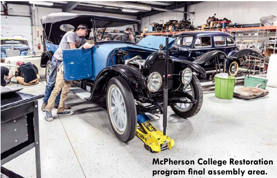
McPherson College Restoration program final assembly area.

The January MCCA Breakfast/Road Trip is one that members won't want to miss. The Saturday, January 28th event will start with a group leaving the Kalp Shop at 8:30 and heading to The Breadbasket at 219 N. Main in Newton, KS. Breakfast is set for 9. Once breakfast is finished the group will continue North to McPherson. There members will get a guided tour of