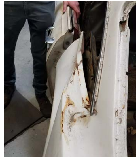
BEFORE: the replacement door shows how much the door post needs to move for proper fit.