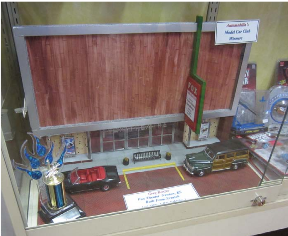
This photo was published in the January 2013 FlatSix Journal. Greg Renfro created this diorama of the Fox Theatre in Newton complete with a Corvair convertible out front. He displayed it at the monthly Wichita model car club and won first prize. Later it was entered in the Great Plains Corvair Roundup model car show and again won first.