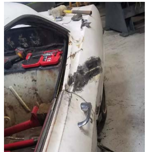
AFTER: McPherson restoration student, Sean Whetstone used his skills to push and pull the damaged door post back into the factory position. He posted a video of the door opening and closing perfectly. This Corsa was stored at the Kalp shop until recently.