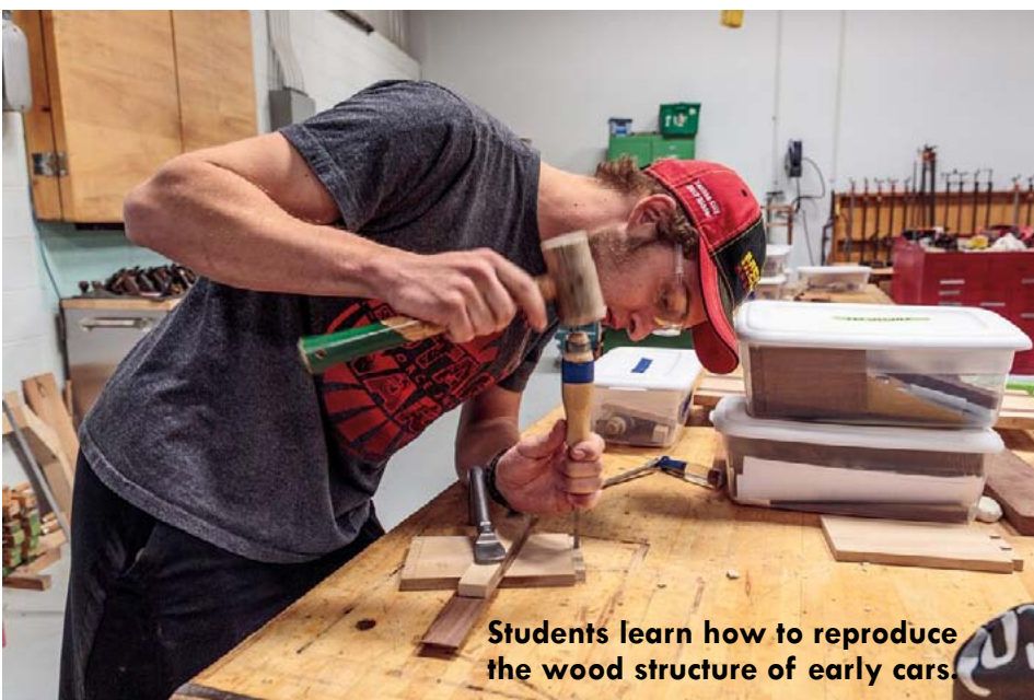
Students learn how to reproduce the wood structure of early cars.

The Automotive Restoration Technology Program at McPherson College was established in 1976. In 1997 this unique automotive restoration program attracted the attention of classic car enthusiasts