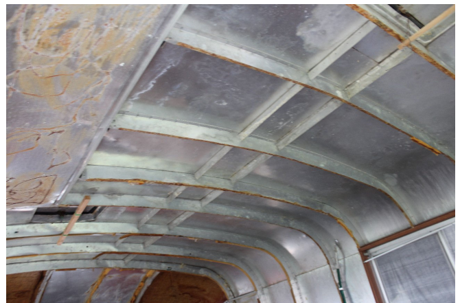
Sort of like Jonah inside the whale? I see all the ribs.