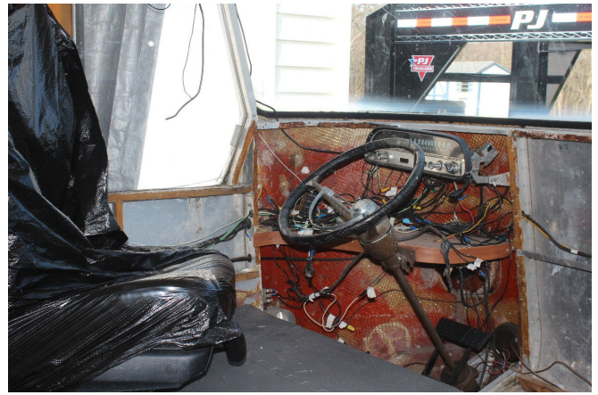
A bit more to go with the dash area

Support CORSA by being a Director- It's rewarding and fun to help CORSA continue and grow! Three Director positions will be up for election in 2023- one in each of the three regions. Learn about the role here or by asking a current director. Policies & Procedures (corvair.org) To be nominated for election, send a brief notice of intent, submit a recent portrait photo, and write a brief bio and statement on how you plan to contribute to CORSA as a board member. The due date is February 10, 2023. Send to aircooled63@yahoo.com or call 803-225-0005.