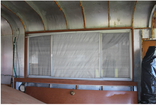
More Ultravan interior pictures