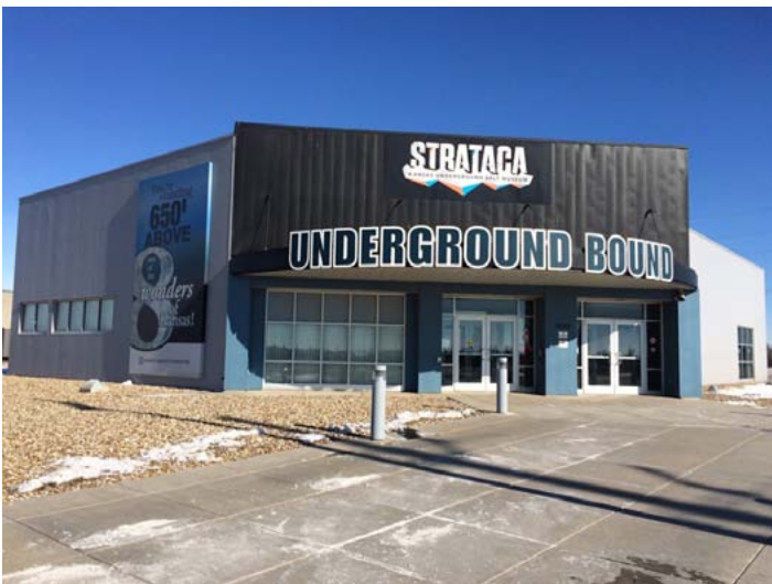
The entrance to the Hutchinson Salt mine. There are decades of history in the mine turned museum.

Their website adds, "Everyone who walks through our doors becomes a part of our underground community. Make memories underground that you and your family will hold close and cherish forever. Join the adventure, book your tour today!"