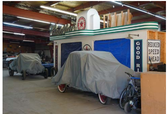
When entering the main Shed building this faux Texaco filling station catches one's eye.