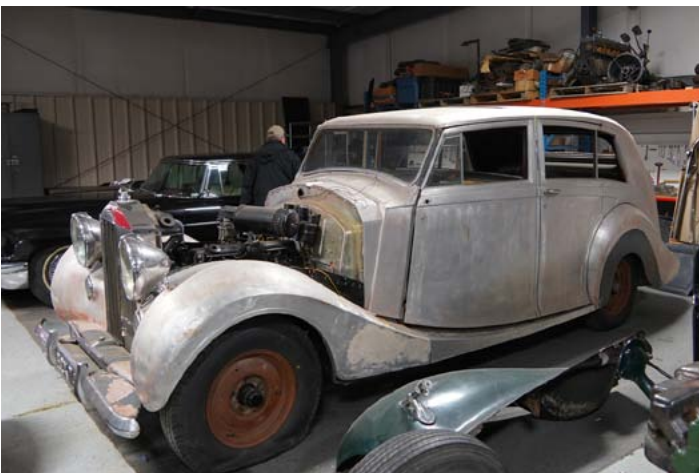
A '50s vintage Rolls Royce was waiting patiently in the final assembly/upholstery area for completion.

The final tour stops were the woodworking and metal forming shops. They concluded a very entertaining and informational outing.