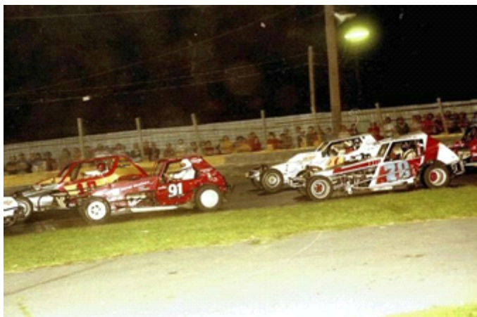
Dorney Park

As a recent transplant to the Lehigh Valley, I find that I miss the old Dorney Park Speedway a great deal. I spent plenty of Saturdays, and a series of Wednesdays, on the microphone at Dorney Park. This was in the early 1980s, and to get there from my North Jersey home at the time I often drove my "Ratvan II" 1962 Greenbrier.