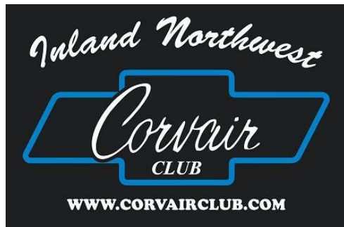
The front of the card looks like this.