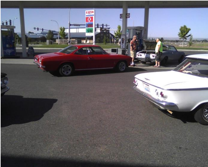
Northwest Econo-Run, Tri-Cities 2015