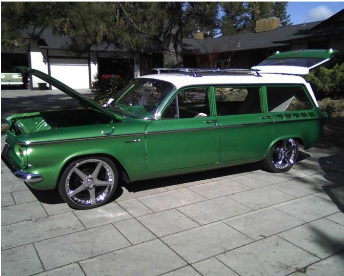
Perfect color for March! At Craig's old place 2016