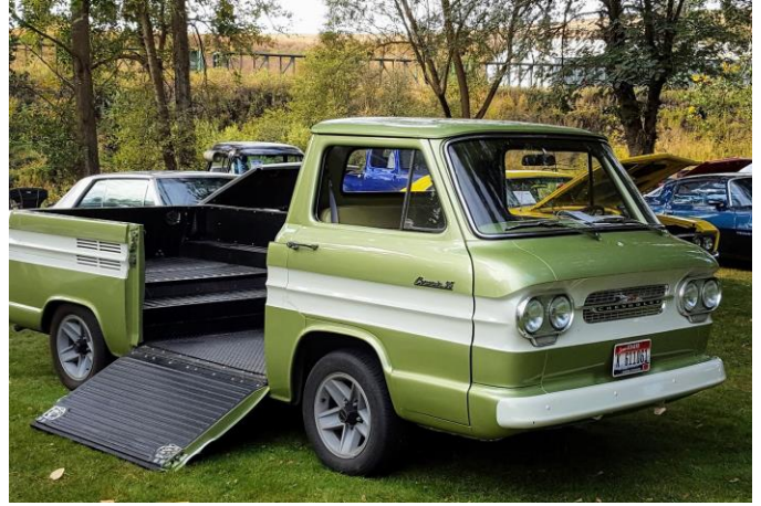
Craig's Rampside at Palouse Days 2018