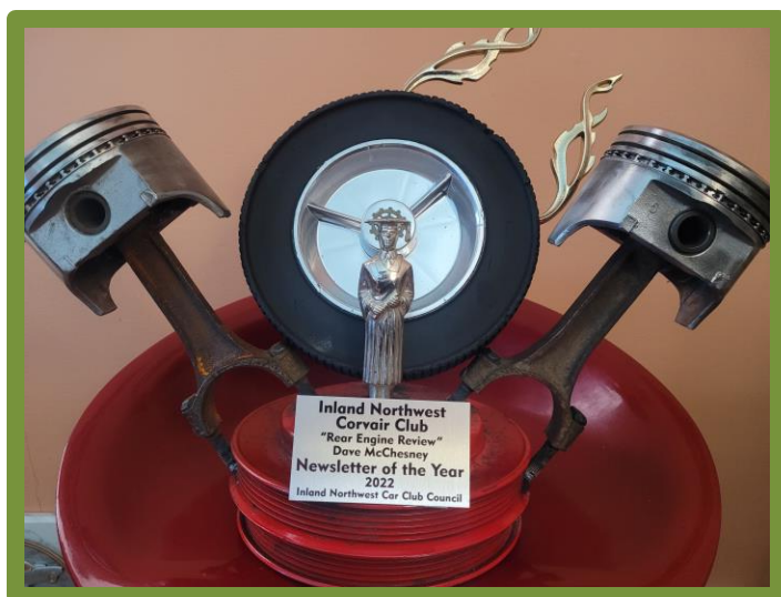
2022 Newsletter of the year trophy

Inland Northwest Corvair Club P. O. Box 9689 Spokane, WA 99209-9689