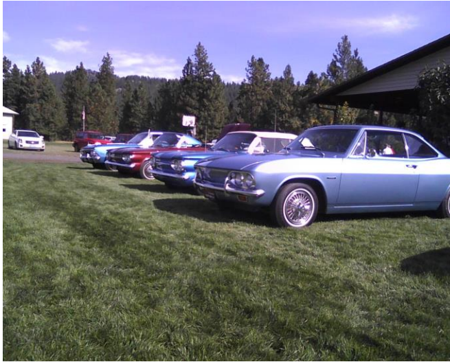
Cider Fest 2013