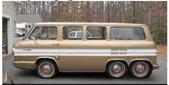
And the late model Greenbrier