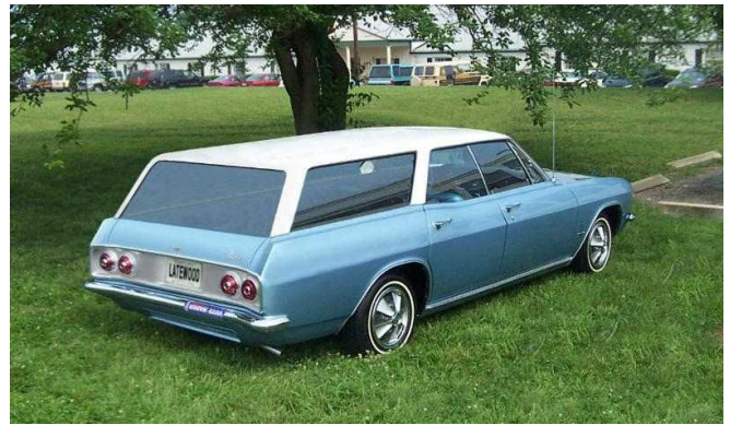
Recently found! Long lost Corvair prototypes. The late model wagon. Lakewood and Nomad style.