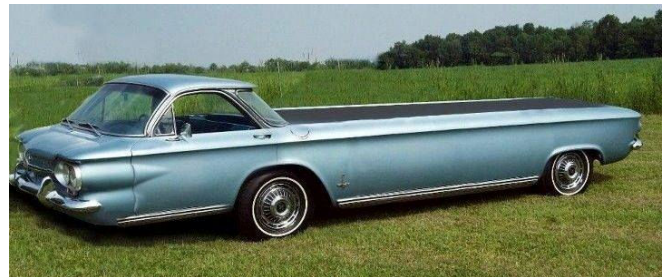
For heavy and long cargo loads