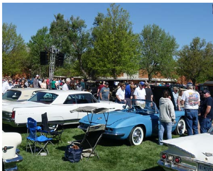
There were between 400 and 500 cars in the show at the 2022 McPherson College car show.

Tours of the restoration program facilities, Jazz Band music, a sub 10 minute assembly of a Model T plus food vendors are also included in the show.