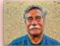
He owns a 66 Corsa.