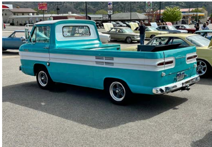
This view of the Tri-State car display shows the variety of Corvairs attending.