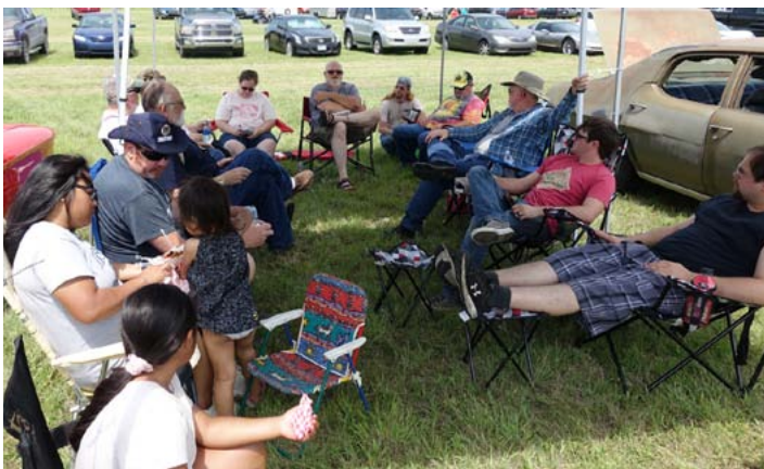
Shade is at a premium at the Afton Show. MCCA brings a couple of dining flies to protect members.

Lake Afton is the largest free outdoor car show in the nation. Not only do hundreds of cars show up, they range from pure stock to highly modified.