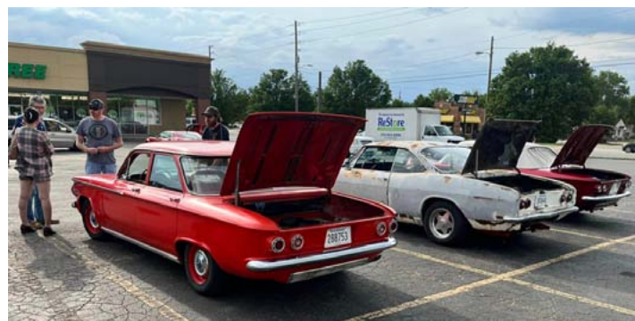
Jason Pool chats up a couple of spectators at the June MCCA First Friday show at Central & West St.