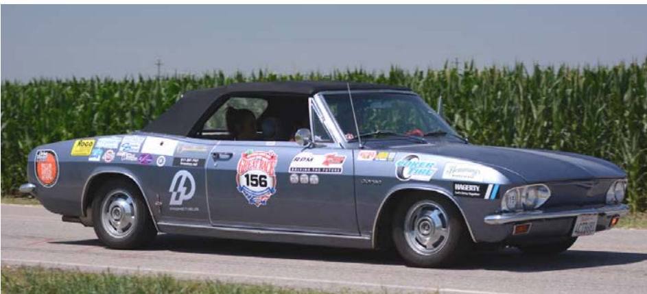
The RPM sponsored 1966 X-Cup class Great Race rally car was captured cruising thru the cornfields between Emporia and Wichita.

The Great Race is a Time and Distance Rally for vehicles built before 1976. The 2,300 mile adventure started Saturday, June 24