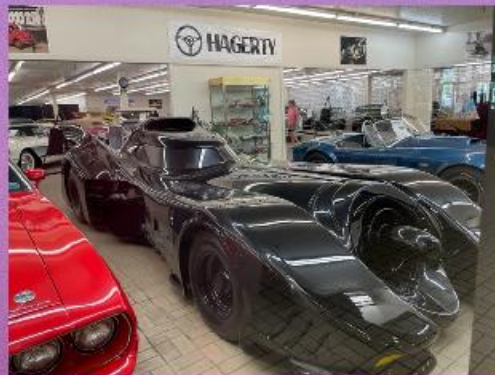
Television Series "Batman" replica.