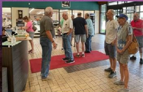
Everyone signing in at Classic Antique Mall entrance.