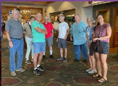
Group gathering inside while waiting for others to join them.