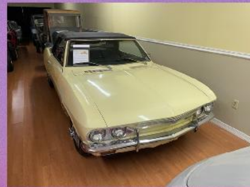
Out of the 900 cars, there was one Corvair for $6500.