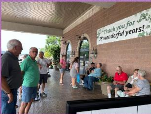
Group gathers outside of Shady Maple Smorgasbord