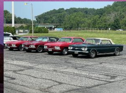
Corvairs line up.