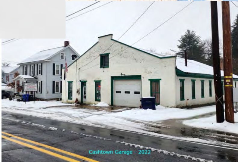
Cashtown Garage - 2022