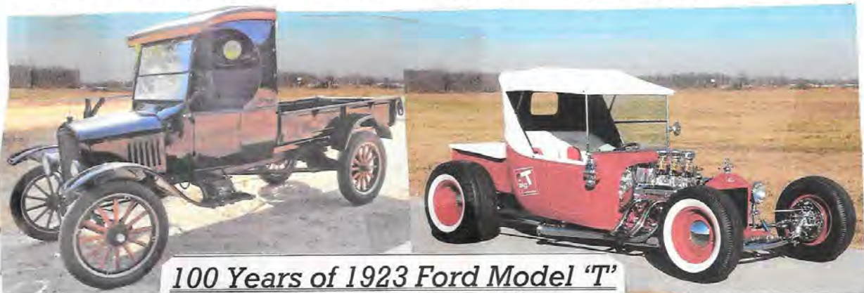
100 Years of 1923 Ford Model 'T'

Open to cars & trucks of all years, makes & models * Entry Fee $15 * 150 Dash Plaques * Top 40 Awards * Participant Judging * Door Prizes * 50/50 Drawing * Food in Mall * Spectators Free