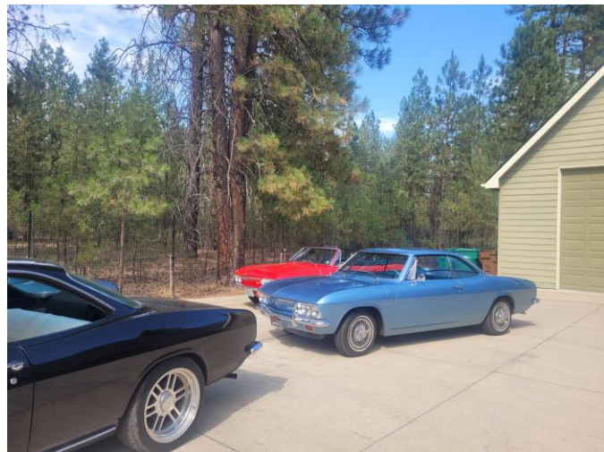
Some of the Corvairs present at our meeting

Because of a medical situation involving our host's family, our quarterly meeting was delayed one week. Instead of meeting on July 23 rd , we met on Sunday, July 30 th .