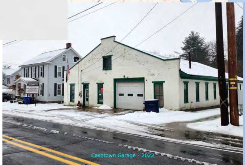
Cashtown Garage - 2022