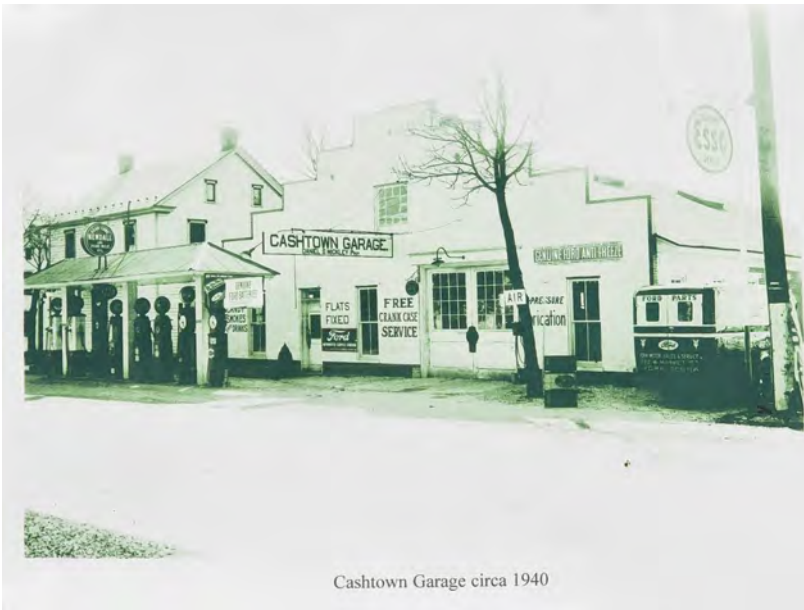
Cashtown Garage circa 1940