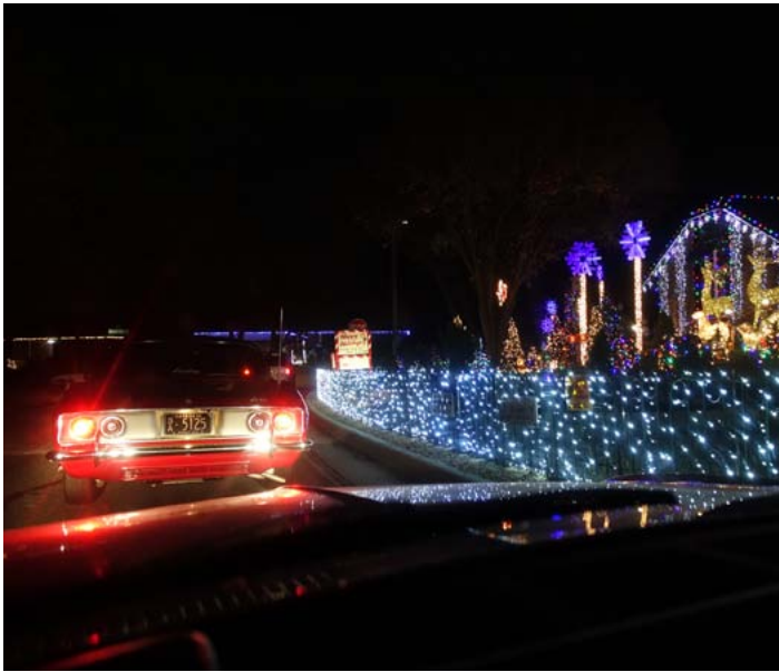
From the December 2021 MCCA Christmas Light Tour. Roy Juenemann's Corsa cruises through a highly decorated neighborhood in Wichita.