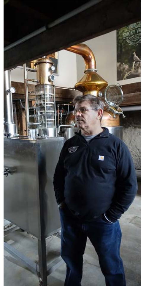
A little bonus on the trip to Marquette was a tour of the Smoky Valley Distillery.