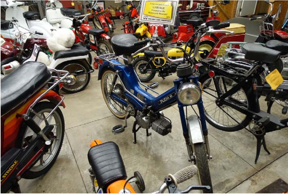
In the center of one room at the Marquette Motorcycle Museum was filled with mopeds and scooters, large and small.