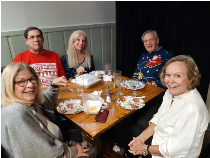
More Christmas Party pics in the online Aircooler.

That's all for now. Happy motoring!! Tom. ■