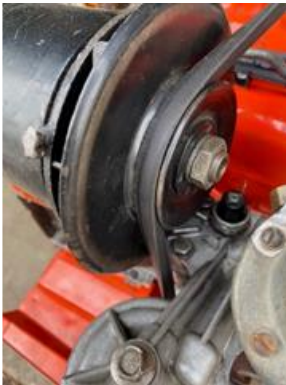
This is how the belt and pulley are designed to fit

The companion to your emergency belt will be your trusty 9/16" wrench. If you have swapped out your idler pulley nuts with the couplers for all-thread rod, you would use a 1/2" wrench. This is a mod that I would suggest because it puts the hex out farther for easier engagement with the wrench.