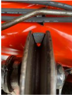
Constant wedgie and belt doesn't reach bottom of the pulley

This month we are going to cover fan belts. Yay!! We all have it written down somewhere that the right belt for our car is a 3V560. Great.... What does that actually mean? Let's look. V belts are broken down into classes. The first or "classical" V belt is generally too big and not the right geometry for a Corvair. These belts are more modern replacements for old leather belts in industrial applications. They have a high tolerance to poor working environments, but let's stop there. In this discussion it's enough to simply know they exist.