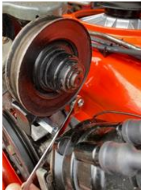
This is the mod using the threaded couplers for all-thread rod with a 1/2" wrench.

That's all for now. Happy motoring!! Tom. ■