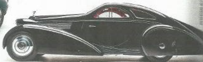
1925 ROLLS-ROYCE PHANTOM I AERODYNAMIC COUPE