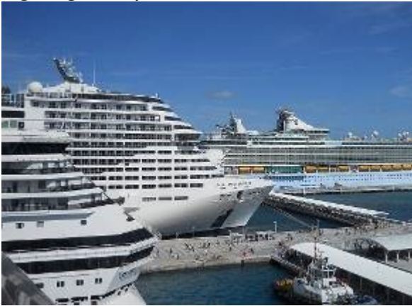
There were six ships beside us in Nassau.