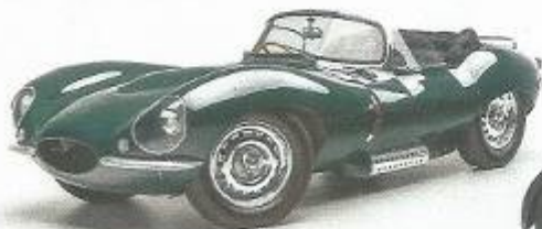
STEVE McQUEEN'S 1958 JAGUAR XKSS

There's plenty of time to check out the "Splendor and Speed" display, which will remain available for viewing until June 2. Visit petersen.org for tickets and more information.