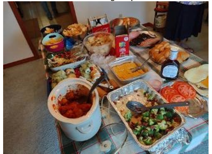
Our Christmas Table was filled with good food.