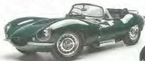
STEVE MCQUEEN'S 1956 JAGUAR XKSS

There's plenty of time to check out the "Splendor and Speed" display, which will remain available for viewing until June 2. Visit petersen.org for tickets and more information.