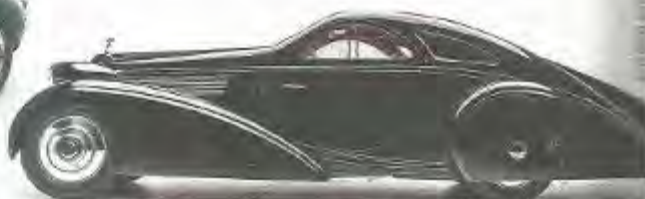
1925 ROLLS-ROYCE PHANTOM I AERODYNAMIC COUPE