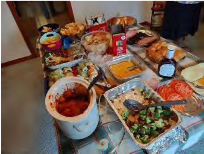
Our Christmas Table was filled with good food.