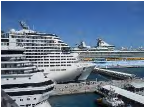
There were six ships beside us in Nassau.