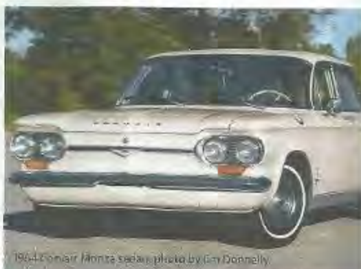
1964 Corvair Monza sedan

The 2024 AACA (Antique Automobile Club of America) Annual Convention will take place near the nation's capital as it prepares for a busy year. The Westfields Marriott Washington Dulles, located in Chantilly, Virginia, will serve as the host hotel for the event that serves as a launching point for the club's upcoming season. There will be seminars to help attendees make the most out of shows and touring events, a trade show, judging schools, banquets, and the highly anticipated national awards that honor AACA members' best vehicles displayed during 2023 in various categories. There will also be a trip to the Air & Space Museum among the tourist attractions in and around the Washington, D.C. area. The convention will be held from February 8-10. Visit aaca.org for booking, discounts, and more.