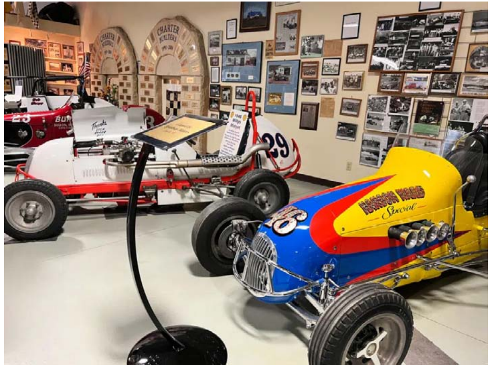
Restored race cars on display are just one aspect of the Kansas Auto Racing Museum. Historic race films and awards are also available.

The Kansas Auto Racing Museum is home to the first NASCAR trophy, first NHRA trophy, restored race cars, rare film footage and memorabilia highlighting racing tradition of Kansas. Much of the