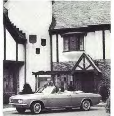
Corvair Corsa Convertible

A new stunner in style and spirit is the rear-engine Corvair. Beautifully different from every angle, Corvair's sophisticated design has an international flavor for '65. This is best shown in its silhouette that's longer, lower and enhanced by a body-length streamline and bold hardtop styling in closed models. Smoother handling, improved ride and stability are attributed to wider road stance and important suspension changes that add to Corvair's proven 4-wheel independent system. Inside, Corvair is roomier with greater value and beauty from an improved heater, smart new instrument panel and luxurious all-vinyl upholstery. Front bucket seats are