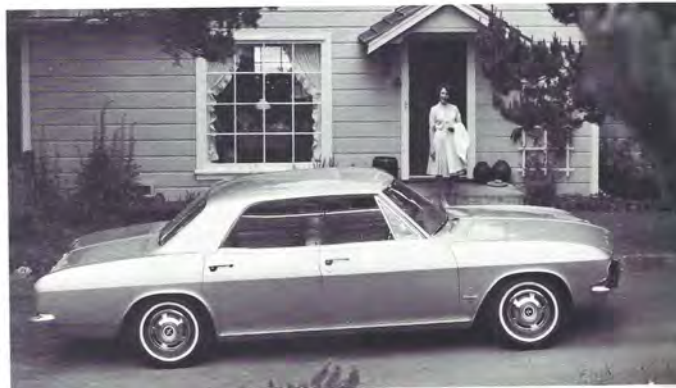
Corvair Monza Sport Sedan