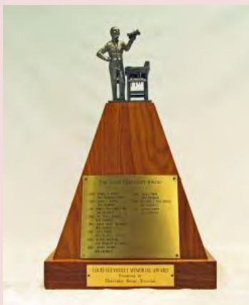
Above: The Louis Chevrolet Memorial Award presented by the AACA