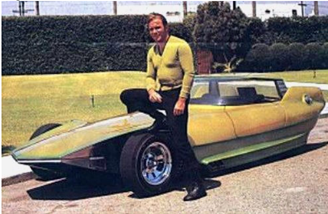
You can see the Corvair turbo motor