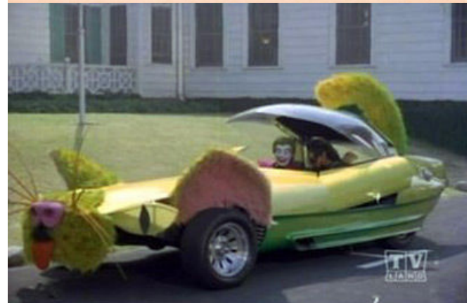
As Catwomans "Cat Car" from the Batman TV series.

is a one-of-a-kind, costing $20,000, made by custom auto stylist and builder Gene Winfield. It really runs, has a radar screen, flip-top roof, retractable fins and a 425-horsepower engine. It also has a hydraulic liquid-on-air suspension system, allowing the height to be changed from a ground clearance of 4 inches up to 9½ inches. It was painted with subtle shades of green over lime-gold metallflake.