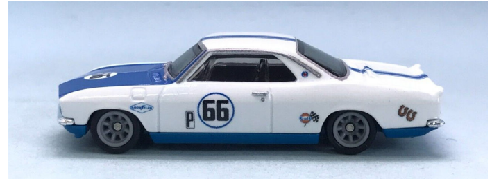
Snowbuster's Swap meet

On a more "affordable" note: Hot Wheels has released as a part of their Hot Wheels Boulevard series a 1966 Yenko Stinger. I like the color of this one better than the Jay Leno's Garage version. Look for this one anywhere you find Hot Wheels cars. Or if you hate the hunt, ebay is easy.