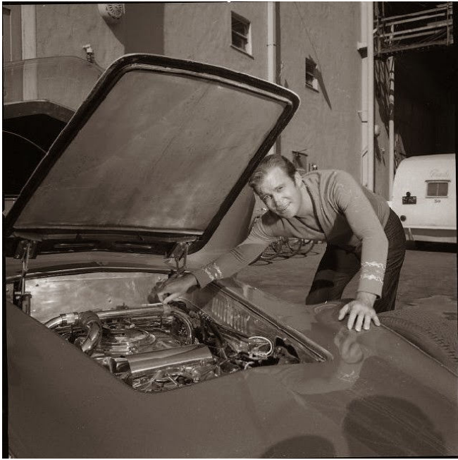
Captain Kirk himself!