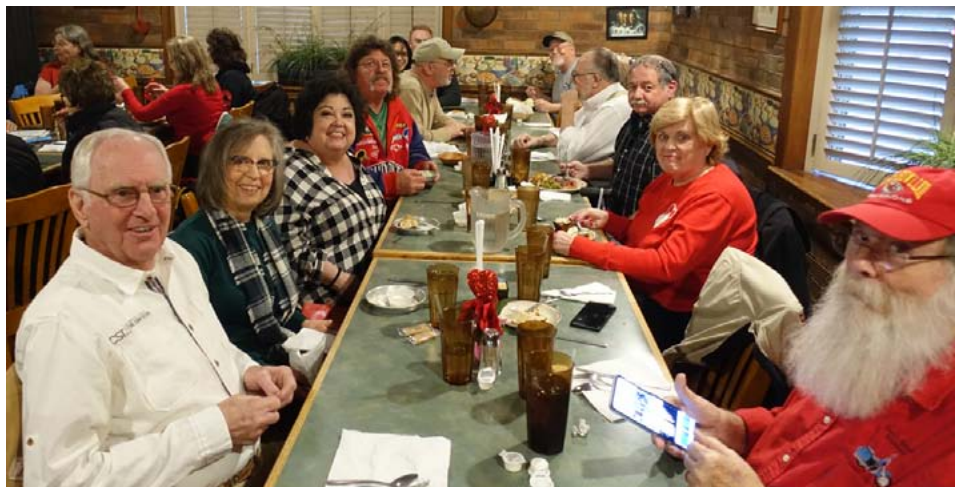
BELOW: MCCA members and guests filled two rows of tables at Spears for the February Pre-Spring Fling.