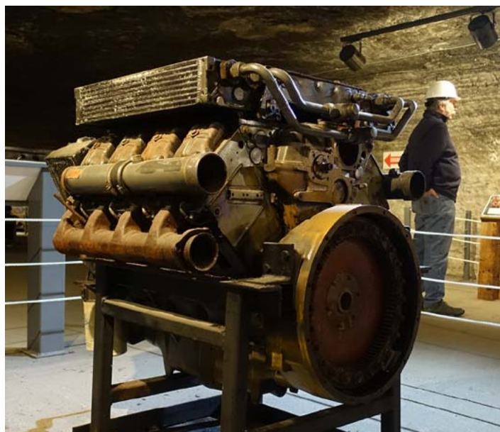
This air cooled Deutz diesel was on display. It had powered some of the heavy equipment miners used.