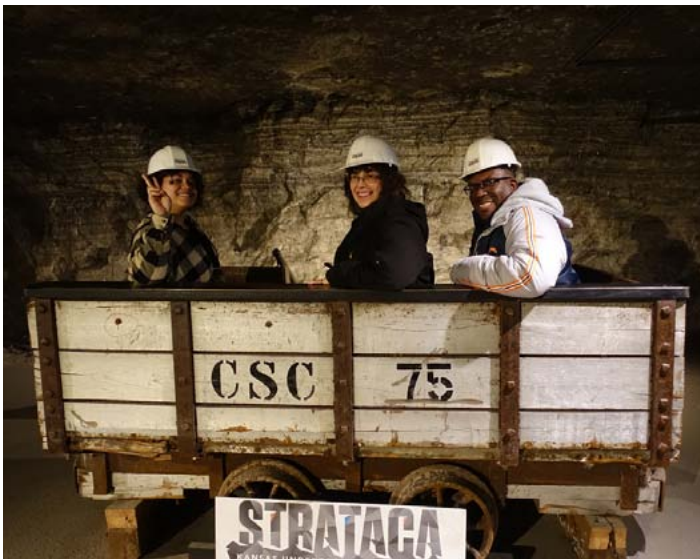
ABOVE: The Trotters took advantage of a rail car turned photo opportunity for a family portrait. RIGHT: An area of the salt mine is used for document and other storage. The steady temperatures make it ideal. Some historic photos from the storage company showed they used Corvans at one time.