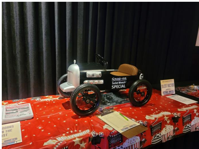
One of the items available by way of Silent Auction.