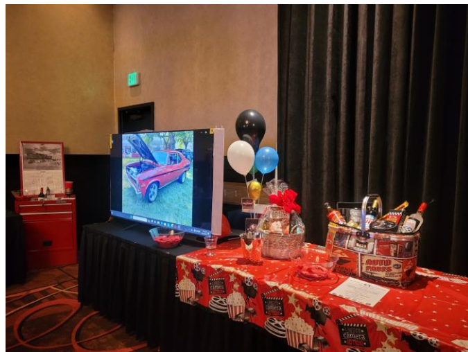
The large screen TV was available via Raffle!

There were a number of prize packages up for bid via a silent auction and still more prize baskets available via a raffle. Highest bids were announced, and tickets drawn to determine winners.