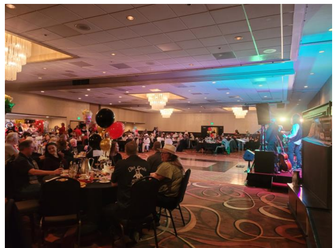
A view of the crowd, with the band behind the lights to the right.