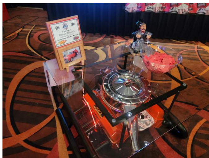
Just what the ultimate man-cave needs... a V-8 under glass, It's not your usual coffee table. This was also available via the Auction.

Lastly copies of the Inland Northwest Car Club Council's Calendar of Events were passed out to those wanting a copy. We were told that this was a proof copy and that the actual calendar would be available at various businesses in the near future. The calendar is a great way to find out what is going on in the car club scene and automotive show scene.