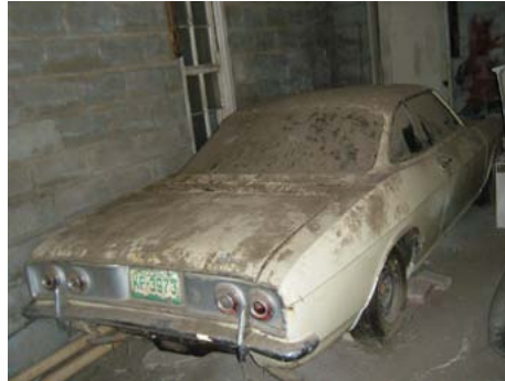
Lyle's Corsa as found in Russell.

We drove to Russell to check out the cars. The 80 cars were parked in rows with barely enough room to walk between them. It looked like a salvage yard, but none on the cars were damaged. Most had been there for decades with high grass and trees surrounding the cars. The 59 chevy was complete, but looked like it was more of a project than I felt I could handle. The caretaker said he had more cars in the barns. I