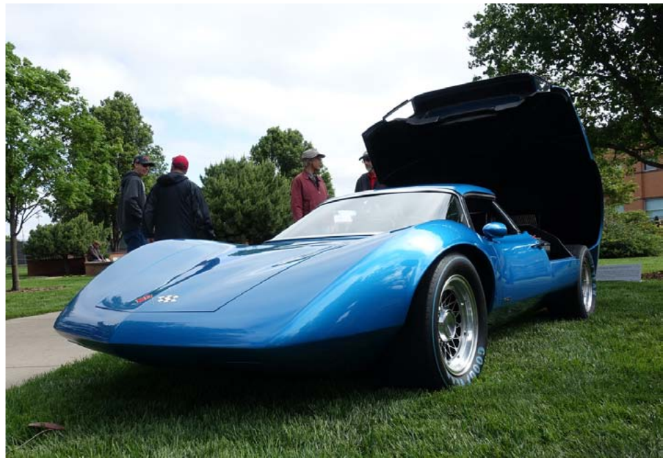
One of the featured cars was the 1968 Chevrolet Astro II concept. It was a test bed for a mid-engined Corvette. It featured a big block Chevy engine and a two speed automatic that looked familiar.

GM Heritage Center museum provided several historically significant concept cars from their collection. Included was the 1968