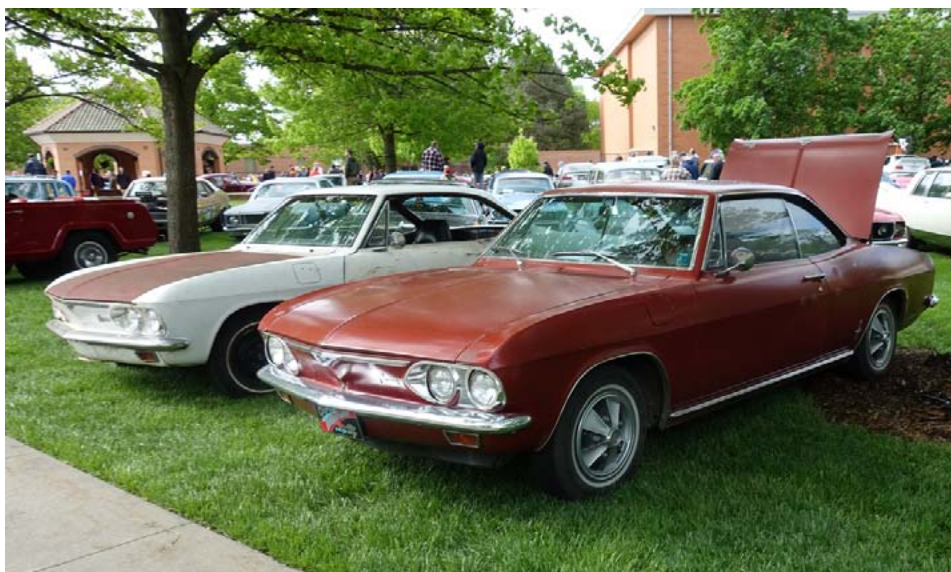
Sean Whetstone's and Edwin Buiter's Corvairs in the student section.