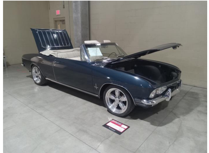
Cody's 1966 Monza on display at the Spokane Speed and Custom Show.