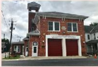
134 East Hanover Street Hanover, Pennsylvania 17331 Phone: (717) 637-6674