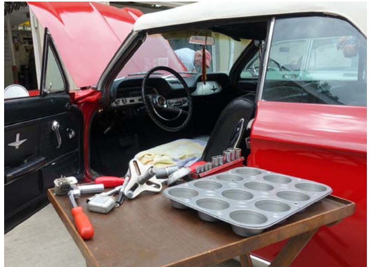
Tools were laid out for some steering wheel work.