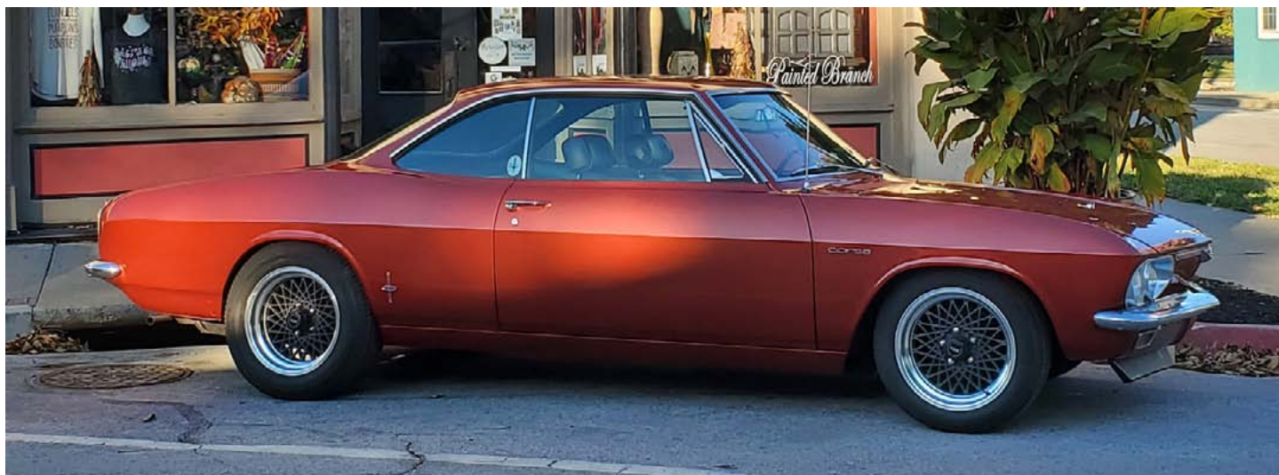
The present configuration of the AC Corsa. Scott enjoys taking it to many of the local car shows.