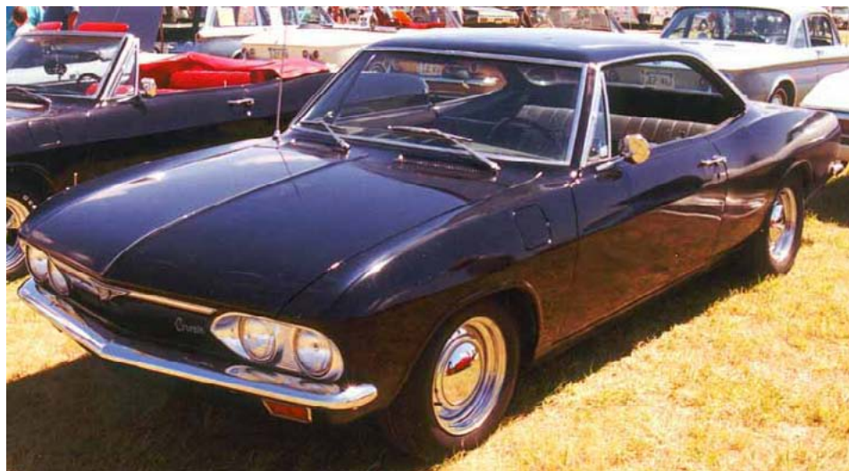
After the accident damage was fixed it got a black lacquer paint job. This photo was at the Lake Afton show where Terry met Mel Horstman.