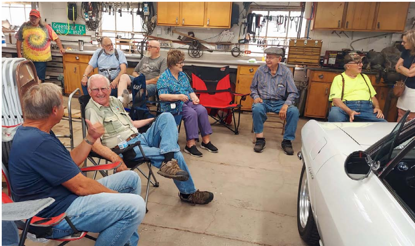
A clutter of Corvair folks socializing and enjoying themselves is what the Tuna's are all about. This jovial group was captured at Juna Tuna, June 15th. For more on Juna Tuna see pgs 4 & 5.