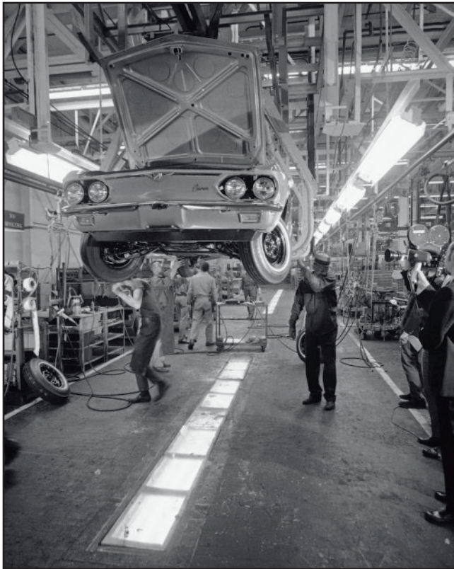
Photo in this post is one of the few images we have of the last made 1969 Corvair (car #6000) on the mini assembly line in the Corvair Room on May 14, 1969. Notice the press off to the right filming the last Corvair being made.

Corvair Preservation Foundation & National Corvair Museum