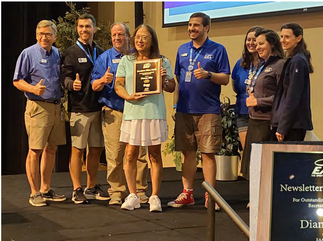
Photo left: The Newsletter Editor Award being presented to me by the staff that judged the newsletters.