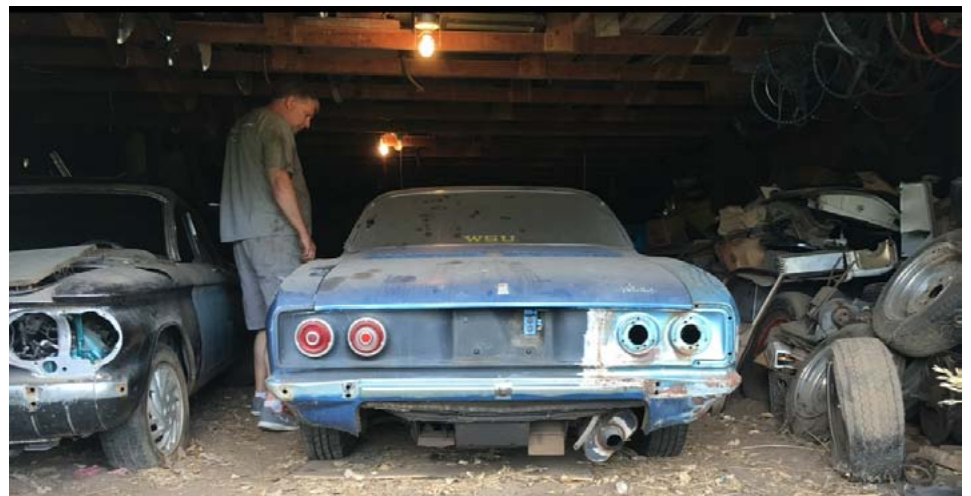
Greg Renfro checks out the '68 500 while it was still at the Kalp Shop. The damaged quarter had been roughed in, but still much work to do.

because it always comes back. The coupe has done several day trips and was my daily driver to and from work between my Valley Center residence and my place of employment in Newton.