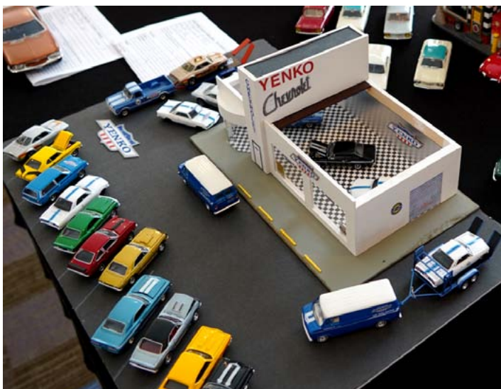
This scale version of the Don Yenke dealership was part of the Model Car competition.