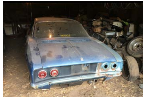
There was a good coat of "Barn Find Dust" on the '68..

because it always comes back. The coupe has done several day trips and was my daily driver to and from work between my Valley Center residence and my place of employment in Newton.