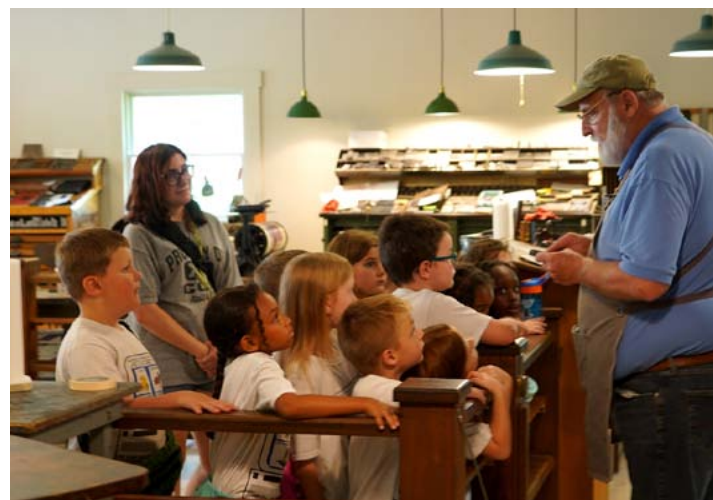
At the park where the Concours was held was a working letterpress print shop. One of the printers explains a composing stick to touring youngsters.