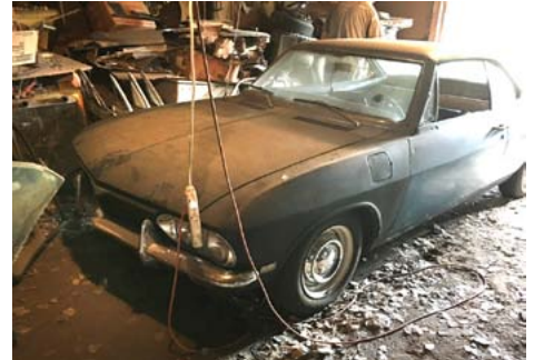
Front view of the '68 before Bill picked it up.

Fast forward to present day, the car has been passed around between a few MCCA members. I have owned the car on 4 different occasions and I currently own the car. I have named it boomerang