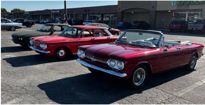
Three Corvair body styles were represented at the August First Friday, coupe, 4-door and convertible.