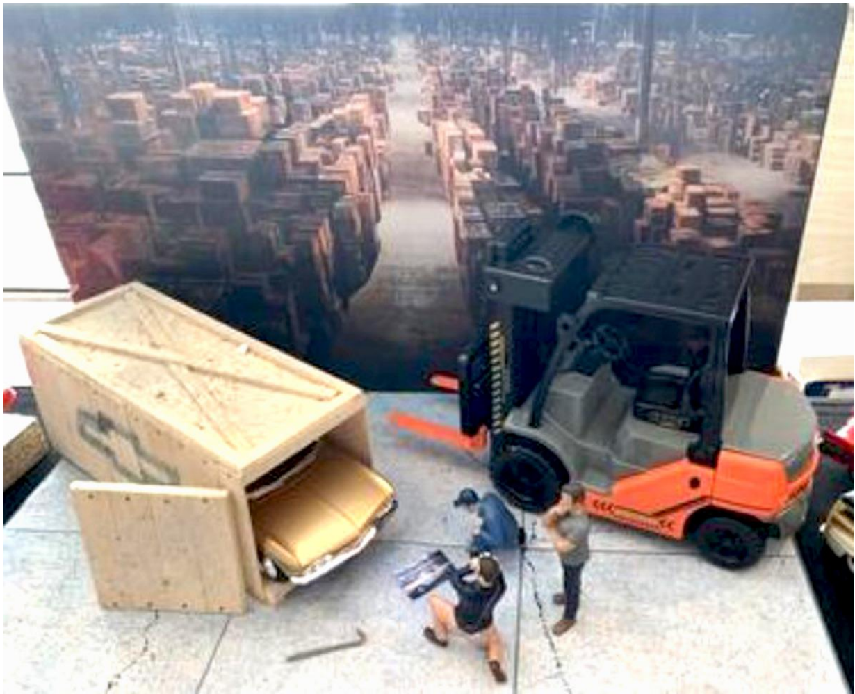
Found! 1969 Corvair 6000, hidden in the secret government warehouse that has the Covenant of the Ark from “Raiders of the Lost Ark”.

(Model Diorama, part of the CORSA Convention model car concours.)