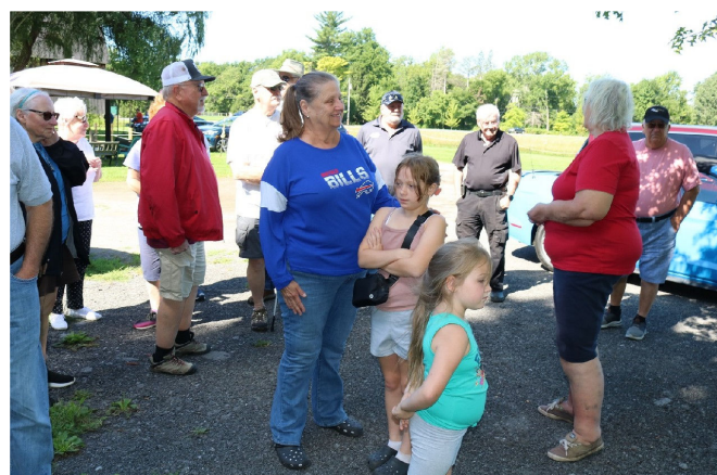
More pictures from the Mud Creek Railroad outing.