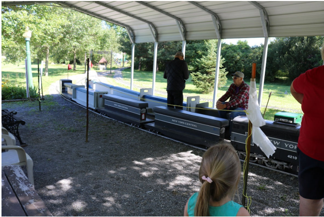
More club trains inside