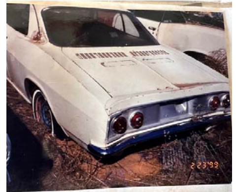
The Yenko engine cover with vents and a short spoiler.

he lived in Helena, Montana. His brother had passed away and he had my Yenko in Helena. His brother had kept all the communications that I had sent him. In one of those letters I had requested that if he ever wanted to sell the car, I wanted first chance. He asked if I was still interested and of course I said yes. He said I will call you back in a week. We both did our research to come up with a price. He called back and we were $5000 apart in price so we split the difference, I drove to Helena in May and picked up my Yenko.