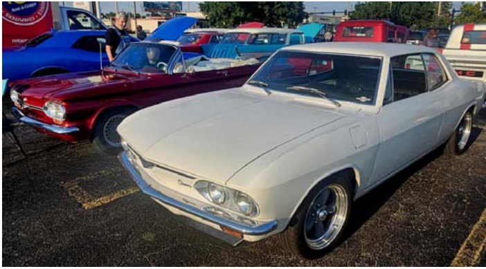
Perfect balance with on Early and one Late Corvair at the Show and Shine.