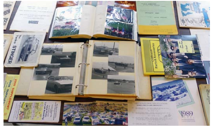
A sample of the many memories at the party. Photos and event posters were just part of the history.