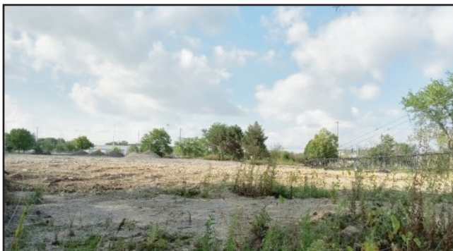
2024 - View from the Hyundai dealership (former MegaCenter) parking lot, looking west. The Pheasant Run Resort is now a muddy field of rubble and weeds.

I don't think we, or anyone else, will be holding a CORSA Convention at Pheasant Run.