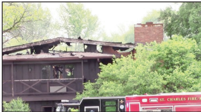
2022 - Burned out Courtyard building.

I heard about the fire on the news and I went out there to take some videos. The fire department was still there putting out hot spots. I could get no closer than parking along the edge of North Avenue. The fire fighters and police gave looks indicating that I should not come any closer. However, they did not indicate I could not use zoom feature of my camera.