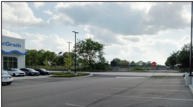
2024 - Same view as above, except that the MegaCenter is now a Hyundai dealership and the Tower is gone.

The ten-story Tower is gone, along with the rest of the buildings and parking lots. It all now is a big field of rubble fenced off by a chain link fence. Normally, a poured concrete building like the Tower would be imploded. However, because of the proximity of the new MegaCenter/Hyundai dealership, an implosion would have dropped the Tower on the dealership. Not good for business. They had to bring in a tall crane with a wrecking ball to break down the building, floor by floor, piece by piece.