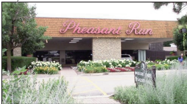
2019 - Lobby entrance to Pheasant Run

CCE hosted the 2001 and 2019 CORSA Conventions at the Pheasant Run Resort in St Charles, Illinois. Both were great conventions, well attended. Pheasant Run had a lot of space for all convention events except the Rally and Economy Run, which were run on the streets around St Charles and the Fox Valley area.