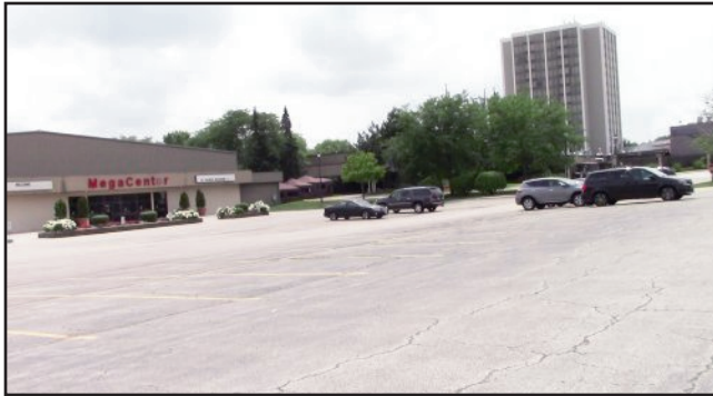
2019 - View of the MegaCenter on the right and the Tower on the left.

time it was different. The MegaCenter has been sold and converted into a McGrath Hyundai dealership. The large parking lot where we held the Concours and the Autocross now holds a lot of Hyundai's for sale.