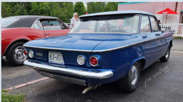
1960 Corvair 700 • East Amherst, New York • July 2024 Pautler's Cruise Night

See more RealRides at realridesofwny.blogspot.com