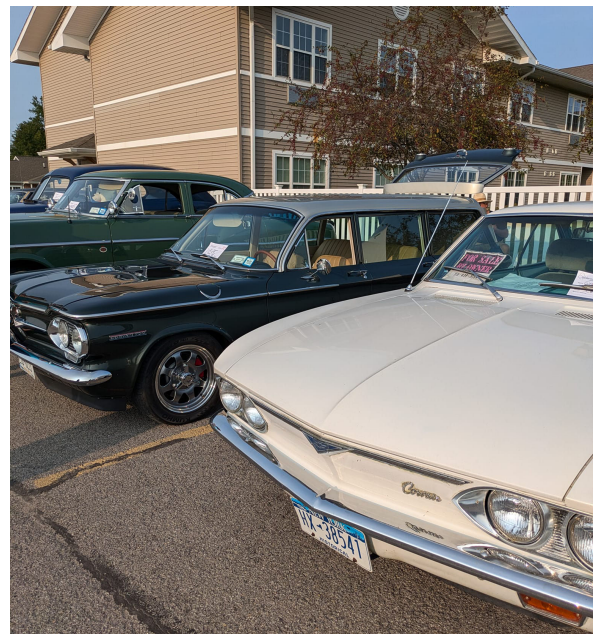
Above, Wheatfield Cruise

Today's RealRide of WNY... in East Amherst Day 4 of a week of early 60s American compacts #1960ChevroletCorvair700