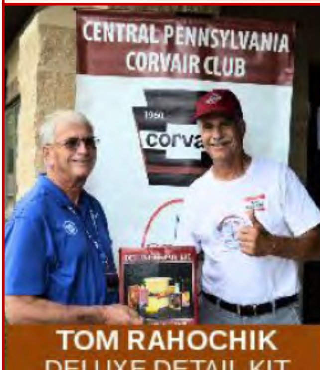
TOM RAHOCHIK DELUXE DETAIL KIT