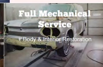
Full Mechanical Service