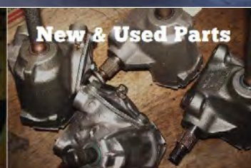
New & Used Parts