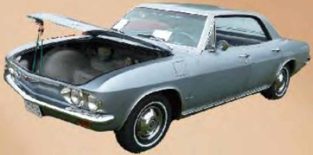
DICK KAETZEL 1965 GLACIER GRAY MONZA 4-DOOR