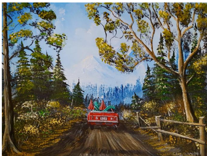
"The Dragon Takes a Drive"... From when I worked at Saint George's School

Here we are, ready to venture into a new year. Ideally, we'll get together soon and plan an event calendar for 2025. We could possibly even do that sometime in January, depending upon what we are all up to. And then maybe some of us would want a bit of time to unwind from the Holidays. I'll keep pushing and suggesting that we should plan for the upcoming year before the old one has ended. That is, have our planning meeting, or at least a preliminary one in October or November, so that when we get to January, we are all set to go.