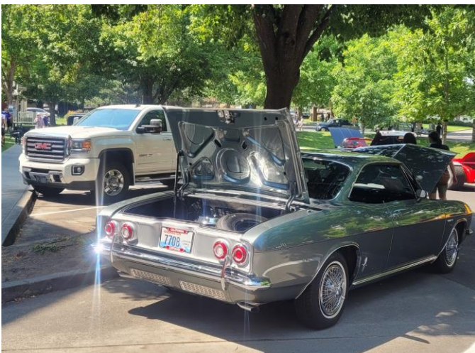
John's Late Model on display at the Touchmark Car Show in August