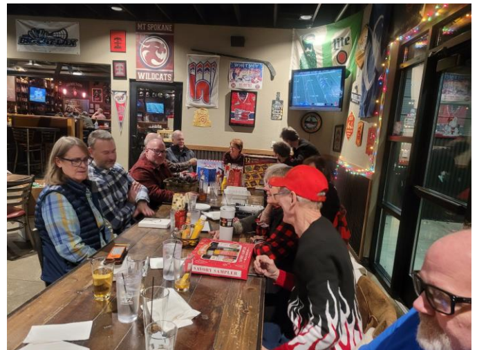
Another view of our Christmas event