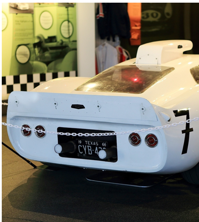
Chaparral 2D tail lights are from a ....(Guess!)

Next Membership Meeting: Place: America on Wheels Museum Date: Saturday Feb. 15 Time: 10 AM to Noon