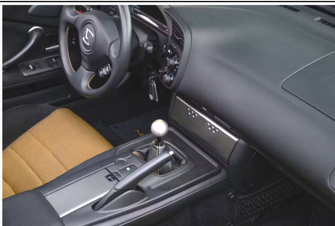
The interior of the 130-mile S2000 CR sold by Bring a Trailer. Bring a Trailer

Are low-mile cars worth the hype? That’s a personal call. For buyers and sellers, the more discerning question may be whether they are worth the trouble.