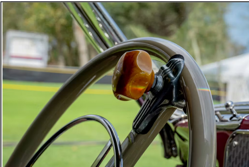
Steering assist knob, an extremely rare piece on the Cord 812. This example belonged to Amelia Earhart. Eric Weiner

Following Cotter's example and hiring a marque expert to inspect a car is particularly wise, especially if you're far from an expert in that model yourself. In some very specific cases— an original car with a very special history, perhaps tied to a person —preserving the character of that may be the top priority for a buyer. In such cases, a private conservation firm is an excellent resource.