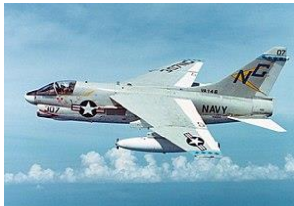
An A-7E Corsair II of VA-146 Blue Diamonds. This is from a few years prior to my time with the Squadron. From the buddy store on the left wing, it appears this aircraft was serving as a tanker.

I wrote the above while serving in the U. S. Navy. I was the Damage Control Petty Officer (DCPO) for VA-146, Blue Diamonds, aboard USS Constellation (CV-64) in the early 1980s. I wrote the original on a typewriter in the squadron's Admin office. I include it here to make use of what would be a page and a half of white space in printed versions of this newsletter.