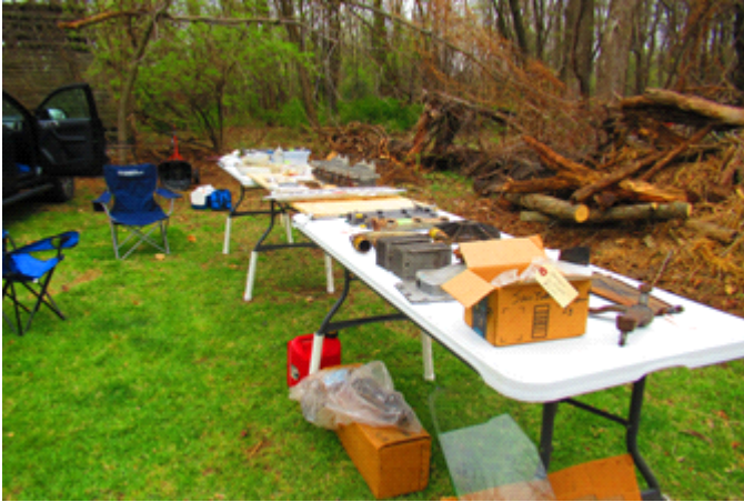
Every vendor offered a wide assortment of clean usable car parts. Two complete Corvairs were also for sale.