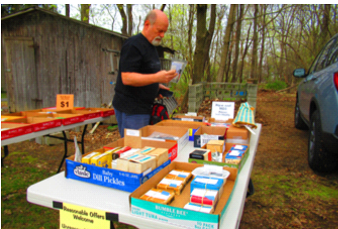
That little yellow sign says, "Reasonable Offers Welcome. Unreasonable Offers Considered!"