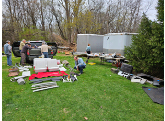
Among other things, a complete white interior in near perfect condition was offered.