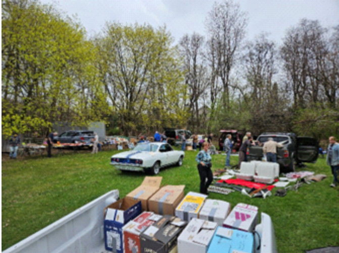
The Swap Meet field at Egerton's Farm. So many Corvair parts for sale!