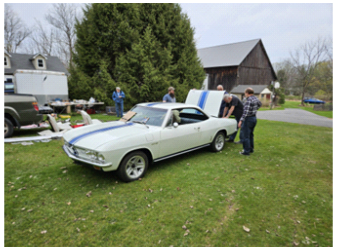
Newly-restored Corvair Corsa. See our classified ads!