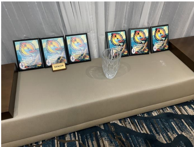
Trophies/plaques collected by Inland Northwest Corvair Club members at the 2025 CORSA International Convention.

It was a great convention! I have a lot more to share on my preparation and participation, but that will have to wait for a follow-on article. In the meantime, keep on "VAIRING!" and hope to see you in Gettysburg!