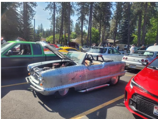
This Nash Metropolitan is painted to look like the body panels are riveted on.