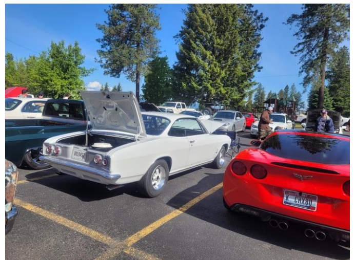
This is the Corvair that was at Cars and Coffee on May 24 th .