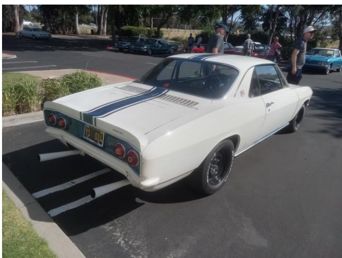
Recently discovered and unrestored Yenko Stinger YS-014