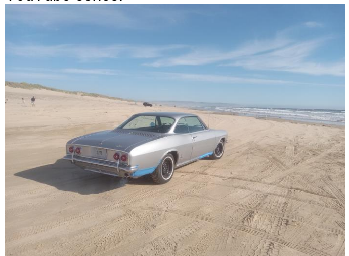
Cody's Corvair at Pismo Beach

Friday was our first Road Rally and then the first Econo-Run. I broke 20mpg per my math, but that was not good enough to place. The car performed great for the 250 miles it was