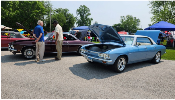
PCCA member cars, including the award winning four door 500.