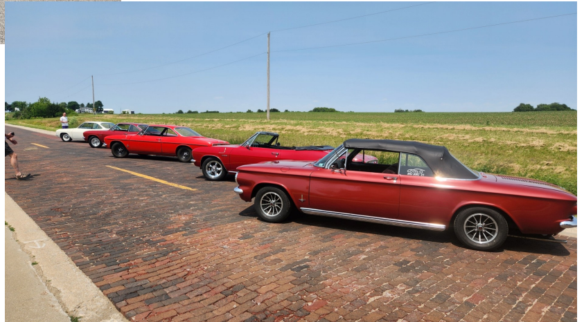
Bottom right: Some of the other cars on display.