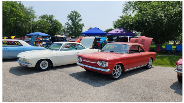
Brandt Teske's sharp Ivory 500 and Geiler's '63 with the nice wheels.