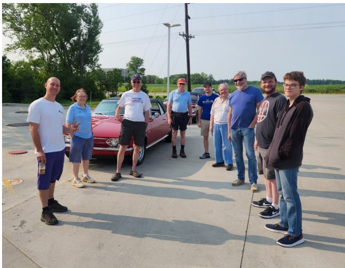
Top: We met up with PCCA members and got ready to mount up.

After saying goodbye to the PCCA members some of the SMCC group drove to a section of the original 1926-30 Route 66 alignment for a photo shoot on the red brick road before driving home. Photos below and on the next page.