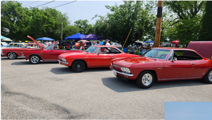
Right: On the Mother Road, Route 66.