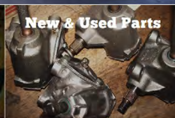
New & Used Parts