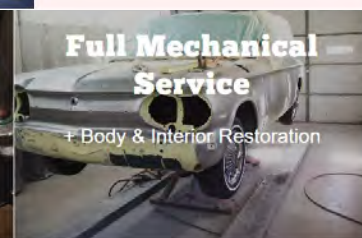
Full Mechanical Service